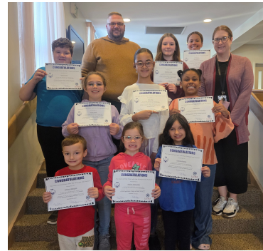
November’s – Created to be GRATEFUL Appreciating and being thankful for someone or something Psalms 136:26

Stay tuned for our upcoming character traits: December; PATIENCE and January; INQUISITIVENESS