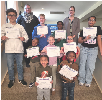
October – Created to be PROUD Respecting and liking yourself Genesis 1:27

The award luncheon for one student from each class that exemplifies the monthly character trait is off to a great start. Congratulations to our October and November recipients: