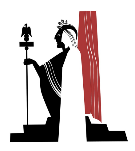
Station I: Jesus Is Condemned to Death

We adore you, O Christ, and we bless you. By your holy cross you have redeemed the world.