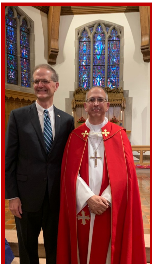
Senator Scott Hutchison was one of over 300 in attendance