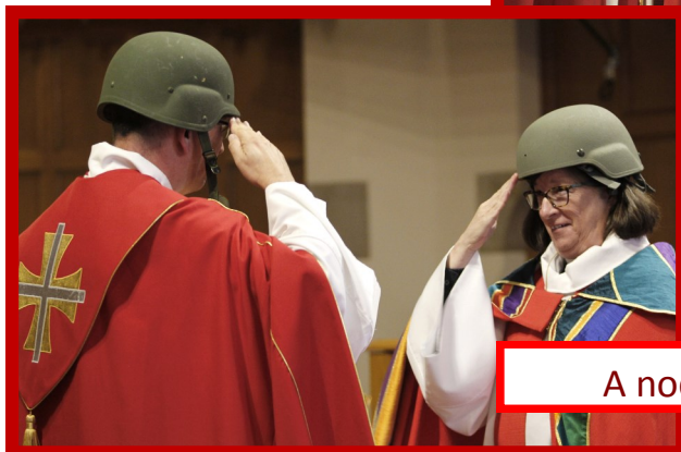
A nod to Military Chaplaincy