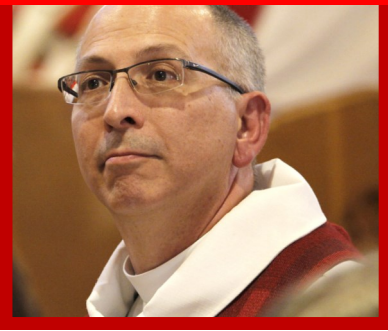
Dreaming of his cookie table